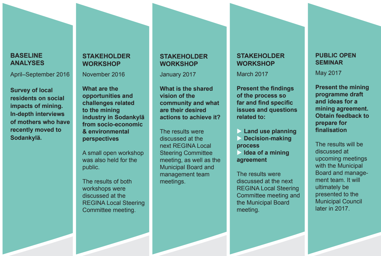
Figure 1: Process to formulate the shared goals and plan the tools for the local SIMP in the Sodankylä municipality in Finland. The steps highlight the process of including stakeholders and local residents, and the follow-up

meetings and development with the REGINA Steering Group, Sodankylä's municipal management team, the Municipal Board, and ultimately the Municipal Council. By Anna Kantola, 2017.